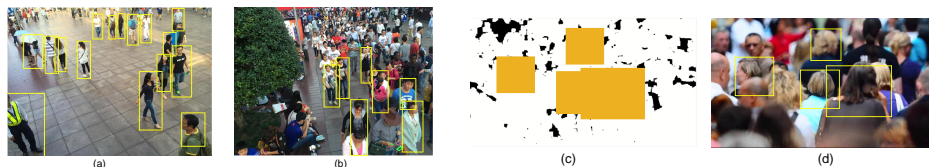
Figure 1: People counting by detection for (a) sparse crowd and (b) dense crowd. Occlusion leads to severe underestimation in (b). These images are extracted from the ShanghaiTech dataset, Zhang et al. (2016). Adaptive fusion used for video-based people counting, (c) foreground segmentation and (d) pedestrian detection. The fusion model combines the people detections with the regression method after de-emphasizing the regions with pedestrian detection (marked by yellow boxes in (c)).

Our crowd level estimation module uses adaptive fusion combining people detection with crowd-level image-feature based regression. The counting-by-detection approach scans the image frame for individual pedestrians and works well for sparsely crowded scenes (Figure 1 (a)), where there is less occlusion. Regression-based counting directly estimates the people count in densely crowded scenes, where occlusion impedes detection of individuals (Figure 1 (b)).