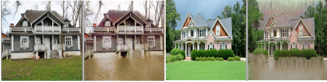
Figure 1: Images of flooded houses generated by our model a

a Note some artifacts in the sky of the second image, most likely due to trees or clouds in the flooding images used for training