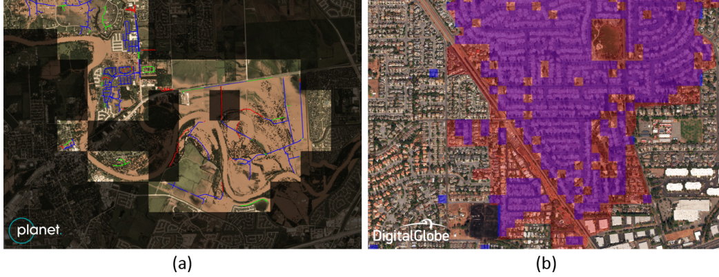
Figure 2: (a) Use DII to infer severe flooding damage areas (highlighted) during Hurricane Harvey, based on changes in detected roads (Blue: true positive, Green: false positive, Red: false negative); (b) Use DII to infer severe fire damage areas at Santa Rosa, based on changes in detected buildings (Blue), compared with shapefile of fire damage area obtained from FRAP [1] (Red)

Figure 2(a) shows a flood affected area impacted during Hurricane Harvey. We can see several roads missing after the flood, which can help us quantify impact of the flood. Finding areas of maximal and minimal change on top of these disaster affected areas, and thresholding and clustering them, we can infer areas of most severe flooding as highlighted in fig. 2(a). The quantitative results from this analysis are presented in Table 1. Figure 2(b) shows change in building structures detected before and after the Santa Rosa fire, and quantitative results are presented in Table 2. Using the human annotated dataset of actual disaster impacted areas for the Harvey flood and the FRAP dataset for the Santa Rosa fire, we are able to prove a positive correlation between DII and actual disaster impacted areas. This can be seen in Table 1 and 2 where the F1 scores indicate the high correlation between the CNN-based change detection masks and the ground truth data both for the pixelwise approach and the DII-based approach.